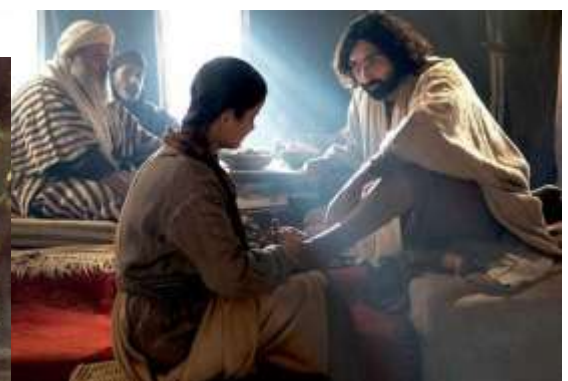
Simon the pharisee, the sinful woman, & Jesus